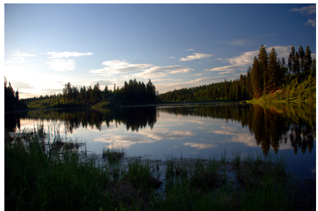
Windermere West Wetlands