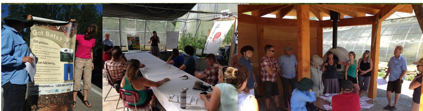
2015 Columbia Valley Local Conservation Fund Field Tour

In June, the KCP conducted a field tour for Local Area Directors and members of the CVLCF Technical Review Committee. This tour visited three project sites where grantees spoke about their projects and answered questions. This tour allowed participants to get a better understanding of the impact of the funding, and allowed them to get clarification on a variety of aspects of these projects.