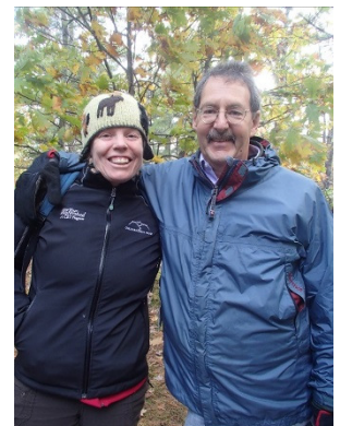
Recipients of the KCP Professional Development Bursary Program