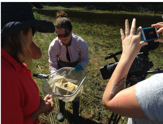
Northern Leopard Frog Reintroduction Project

The KCP's Stewardship Tracking Report was completed for the 2015-16 fiscal year and the Stewardship Map was updated with 2015 project activities. The KCP completed its Conservation Network Map which visually displays the social network through a relationship map that can help us understand what the collaboration looks like spatially.