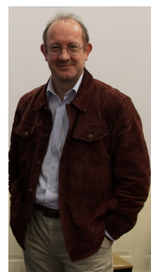
Presenters featured in the KCP Winter Webinar Series