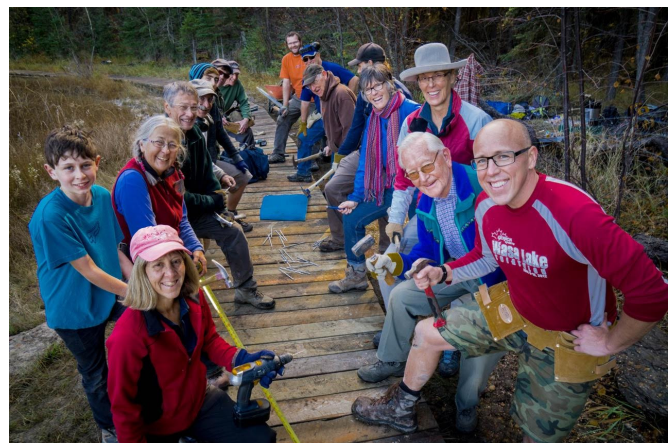
Lake Enid Restoration Project