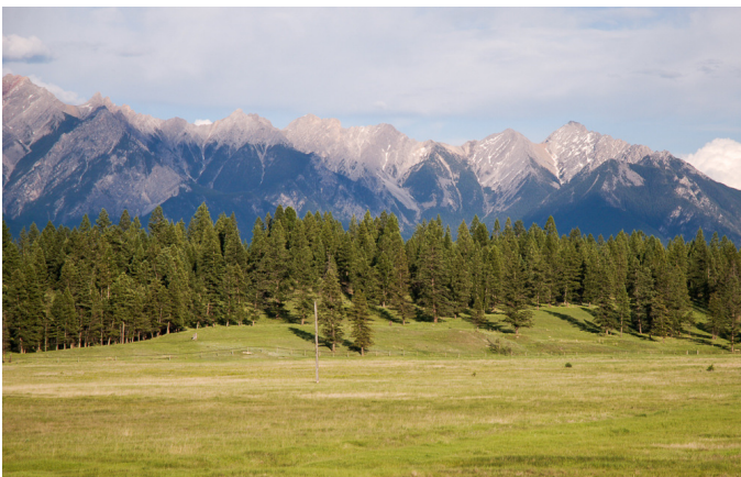
Windermere West Grasslands

In 2015-16, the KCP continued to coordinate communication between the land trusts in the region. The KCP received 18 land securement referrals from with KCP partner organizations or directly from interested landowners. This year, the KCP undertook four property evaluations and updated our securement rankings accordingly. Based on the dedication and hard work of our partners, the Windermere West and The Land Conservancy - Kootenay Lands projects were completed this year.