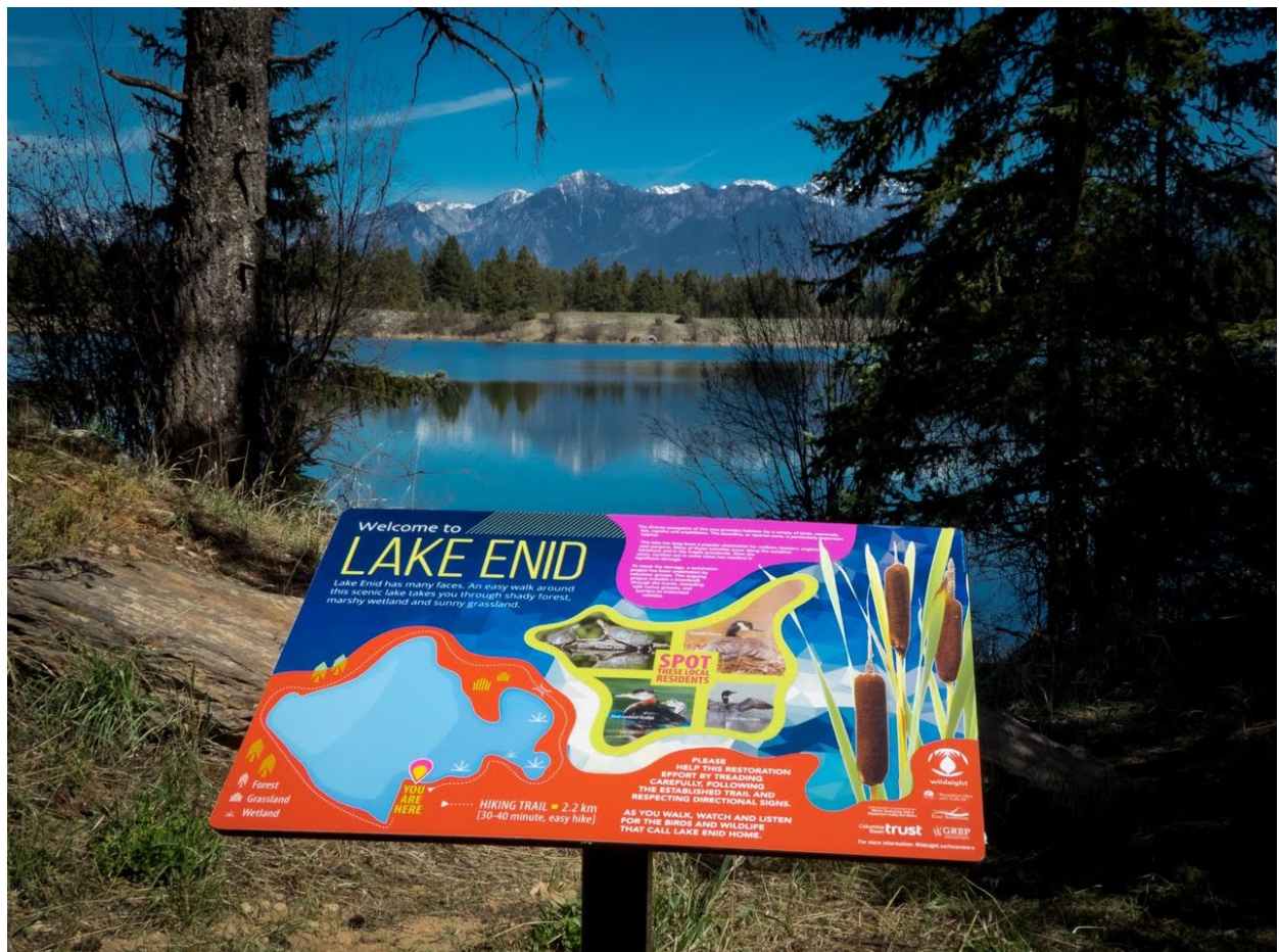
Lake Enid Restoration Project by Wildsight-Invermere.

In 2015, the Kootenay Lake Local Conservation Fund (KLLCF) was established by the Regional District of Central Kootenay in three electoral areas (Areas A, D and E). The KCP continues to work with the RDCK to deliver the Kootenay Lake Local Conservation Fund. The KLLCF will be used to support high priority projects in the Kootenay Lake area beginning in 2016.