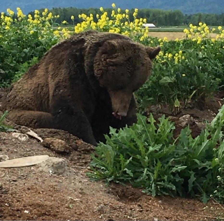
Abundance of unmanaged agricultural attractants in Creston linkage area